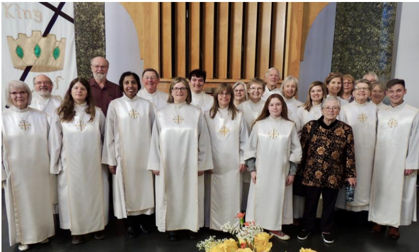
FLC Choir, early 2020