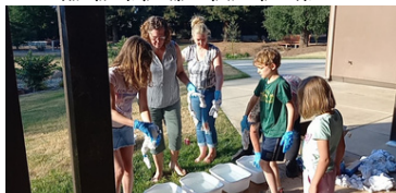
EVEN MORE VBS FUN