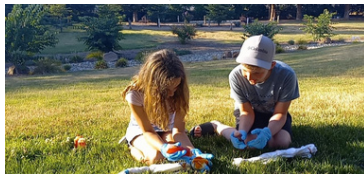
FUN AT VACATION BIBLE SCHOOL